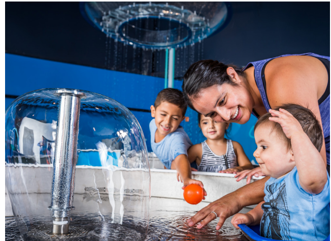
Orlando Science Center

The initiative was launched in 2014 as a strategic partnership between IMLS and ACM, in service to both organizations' strategic goal of providing greater access to museums for all children and families. The initiative was also informed by several research studies from the museum field showing that early access to the informal learning opportunities offered by museums and other cultural organizations leads to positive impact in children's development and academic performance.