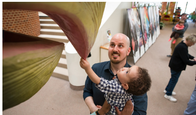
Alden B. Dow Museum of Science & Art

“I have seen many families enter our museum with a sense of hesitation, assuming they won't be able to stay for a visit, unaware that we are a Museums for All institution. As soon as I let them know, I see a sense of relief and a smile.”