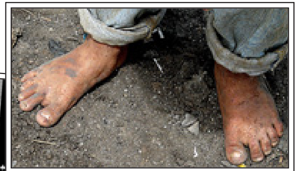
"Feat" by Kelton Woodburn, 17