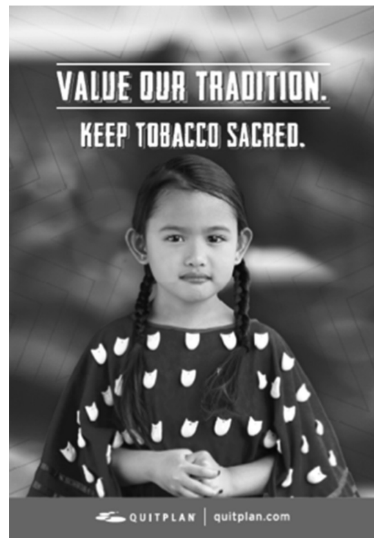
Figure 5 Minnesota example of counter-marketing strategy against tobacco industry misappropriation of American Indian tradition. 59

included. For example, we were unable to find any internal documents from SFNTC prior to 2002 (when SFNTC was acquired by RJR) because they were a small, private company and not subject to the disclosure requirements of the Master Settlement Agreement. 60 Given the scope of our research question, we excluded documents regarding the complex issues of sovereignty and tribally owned tobacco entities. These issues warrant further examination and need to be respectfully considered in light of the complex political and economic realities facing American Indian tribes. 7 61