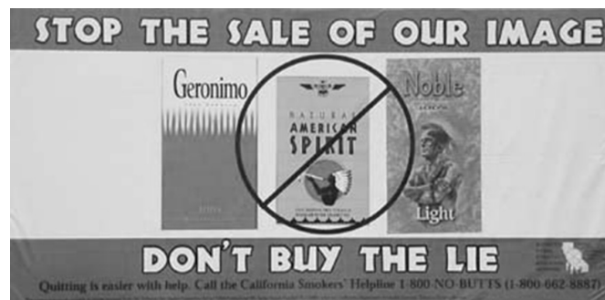
Figure 4 California example of counter-marketing strategy against tobacco industry misappropriation of American Indian tradition. 58

Our study has several limitations. Because some of the industry documents are restricted (due to confidential information) and of the sheer volume of documents, we were unable to determine whether all documents relevant to our research question were