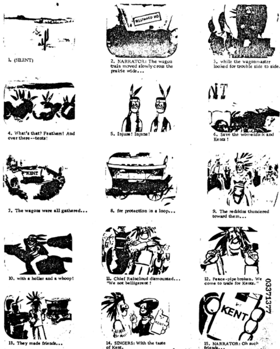
Figure 2 Script for Kent cigarettes television commercial 'Wagon Train'. 31

This continued with images portraying American Indians on packages. One 1990 B&W advertising document described a low-tar cigarette as: