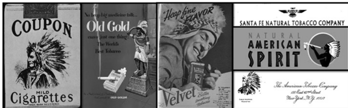
Figure 1 Examples of American Indian images used in tobacco industry marketing. 24–26 34 42

An overall shift in the tone occurred during the 1980s and early 1990s. Rather than relying on negative American Indian stereotypes, ads instead began to convey a sense of reverence towards Native people and their use of tobacco. For example, a 1980 pitch for ‘Indian country cigarettes’ from AT stated: “In the more sophisticated atmosphere of the 1980s, there should be an opportunity to use the image of America’s original frontiersman: THE INDIAN. The Indian is also the original cultivator of tobacco and the American Tobacco symbol”. 32