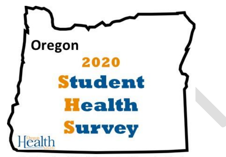
Helping all youth to be happy, healthy and resilient

This is NOT a test. There are no right or wrong answers. You don't have to take the survey if you don't want to.