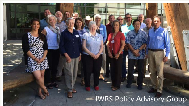
IWRS Policy Advisory Group

The IWRS Policy Advisory Group will hold its third meeting on Wednesday, September 14 at the Water Resources Department in Salem from 9:00 am to 5:00 pm. The fourth meeting will be held on Wednesday, December 7, 2016, also in the same location. If needed, a wrap-up meeting may occur in 2017. Meetings are open to the public. For more information, including agendas, meeting materials, and notes, please visit this website .