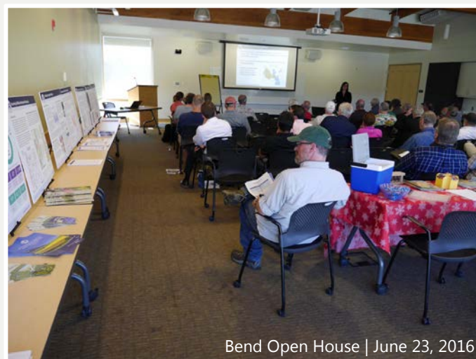
Bend Open House | June 23, 2016

The results from the seven open house events, online survey, and individual comments are now available on the IWRS website. Nearly 200 people attended the open houses and more than 65 individuals responded to the survey. The public input received to date was shared with the Water Resources Commission during its August 18 meeting. The open house presentation and poster displays, featuring key implementation activities, are also available online. Thank you to everyone that participated or helped promote these events, donated materials for our kid's activity table, or assisted in numerous ways during the open houses.