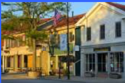
It takes a Community