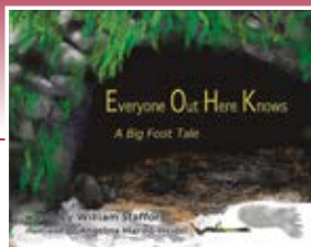
Everyone Out Here Knows: A Bigfoot Tale, by William Stafford