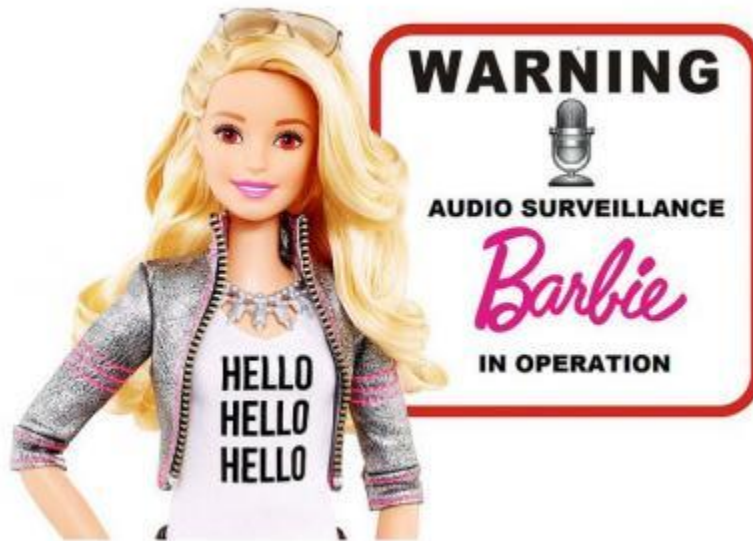
Hello Barbie

Feel free to contact us at lib.ifc@multco.us .