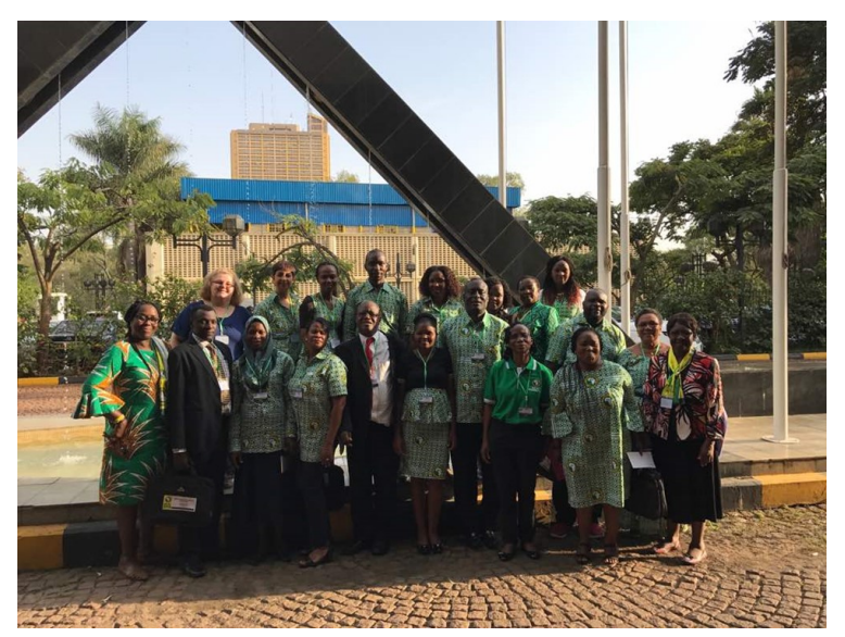
AfLAc participants, coaches, and facilitators at Laico Regency Hotel, Nairobi Kenya

The assignment of developing and implementing a project in the community is positively stretching the skills and knowledge of all the participants. As required by the academy all participants are expected to develop a project of their choice to address their community needs through libraries. Thus far, this activity is achieving great results as participants are meeting with and listening to various members and stakeholders in their different communities. These projects are in progress and participants are eager to present them at the African Public Libraries Summit in July 2018 in Durban, South Africa. Clearly, every participant is working hard to ensure that their project is worth reporting at the summit.