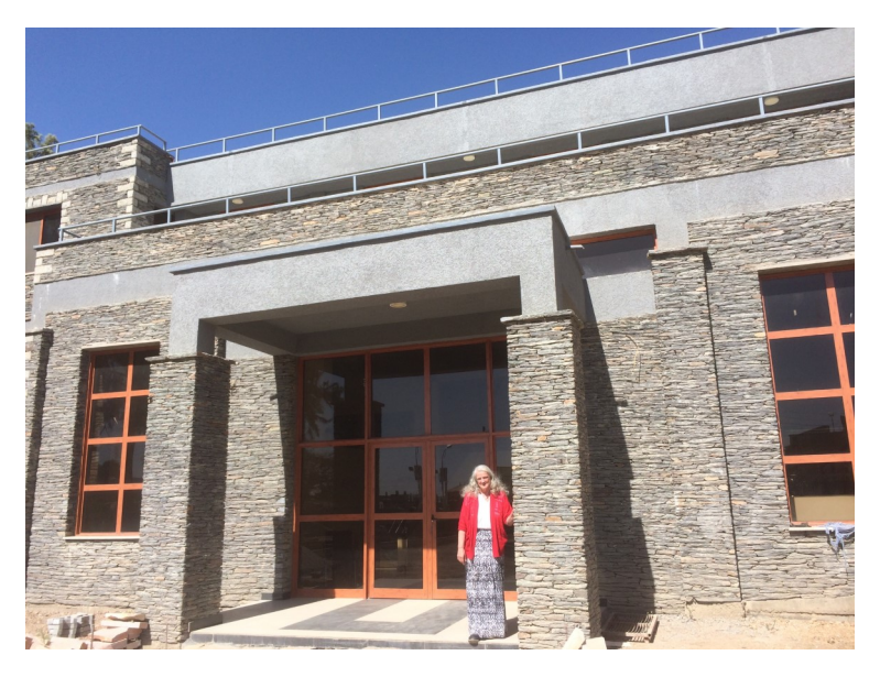
At the entrance of the Axumite Heritage Foundation Library.

Will my objectives be met by June? Time is fleeting and a certain sense of panic is setting in. Even so, I know much can be accomplished at a distance if need be and I have more excuses to return to a place that has become my home and a people who have become my family.