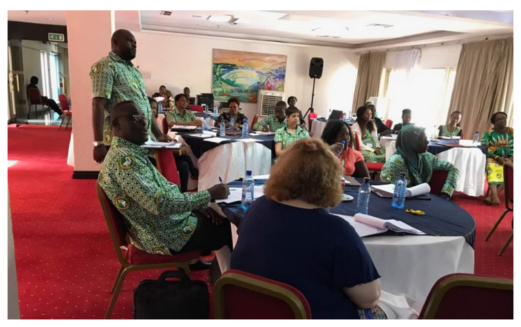
Participants learn leadership skills at the AfLAC training.

Participants are working in different areas including agriculture, health information, bibliotherapy, environmental issues, access to information online, economic empowerment, and improving the reading culture in their different communities.