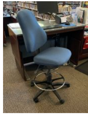
Armless blue stool QTY: 2