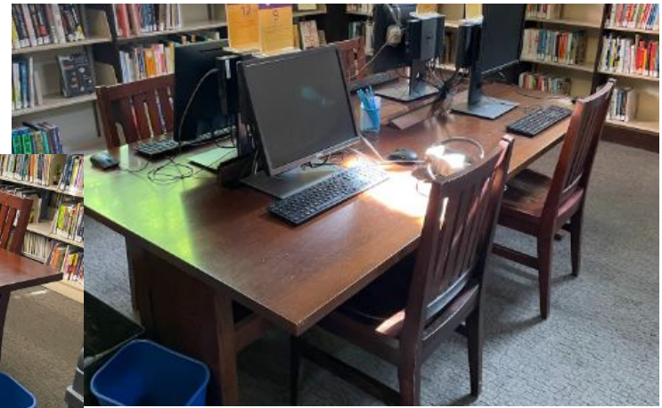
Wood table with electrical -