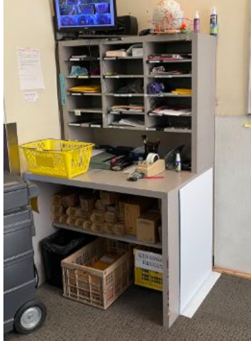
Mail Station 44"x32"x70"