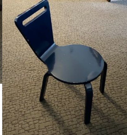
Kids chairs QTY: 8