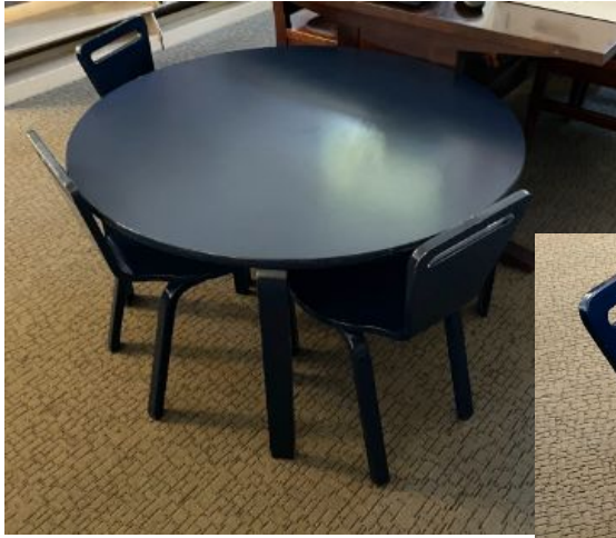
Kids table 42"(dia)x23" QTY: 2