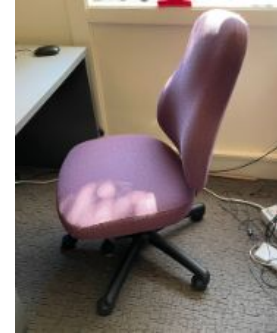
Purple chair (3) armless; (1) arm QTY: 4