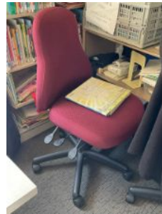
Armless red chair QTY: 2