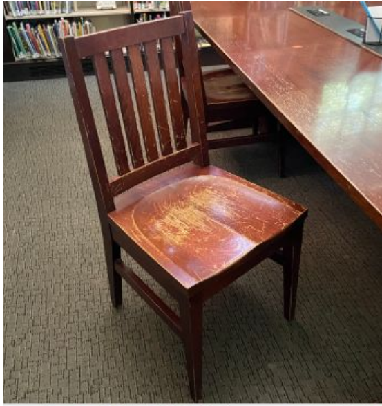
Wood chair QTY: 32