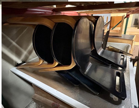
Dark blue chair w/wood leg childrens chair Qty 9