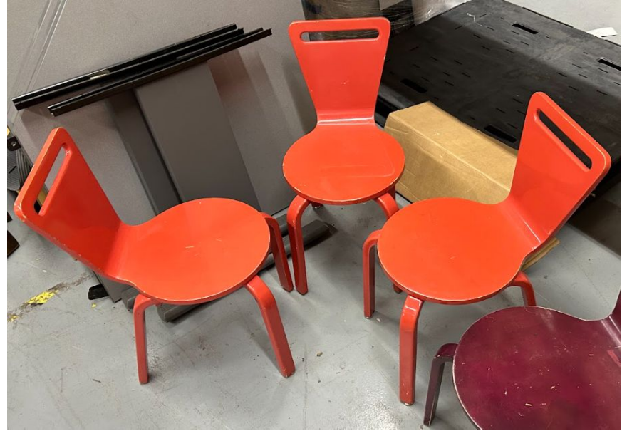
Red childrens chair Qty 3 (no matching table)