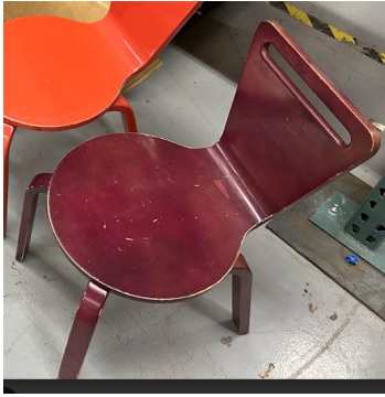
Burgundy childrens chair Qty 4