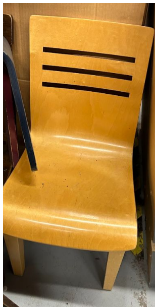
Maple wood finish children chairs Qty 1