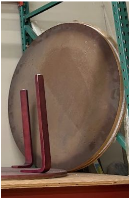
Maple wood finish childrens table (new?) New legs in box. Needs assembly. Approx 42" circle (image is underside of table)