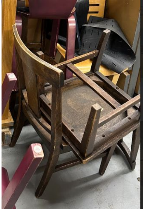
Wood finish childrens chairs Qty 4