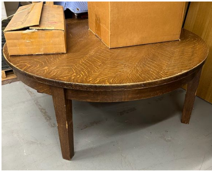
Wood finish childrens table Approx 48" circle