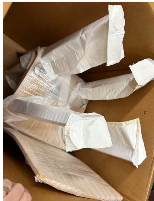
Maple wood finish childrens chairs - new in box Qty 2

Note: I think these chairs all match, but with natural wood aging, it's hard to say if they are the same. Similar with the table.