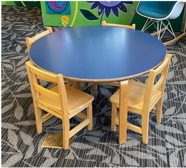
Childrens table 42" & 4 chairs (set)