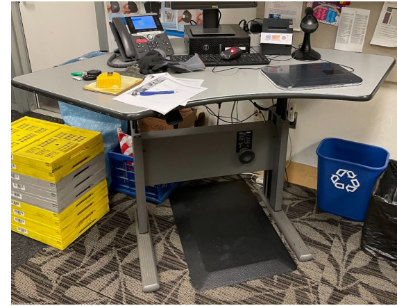
Manual corner Sit/stand desk 64"x43"