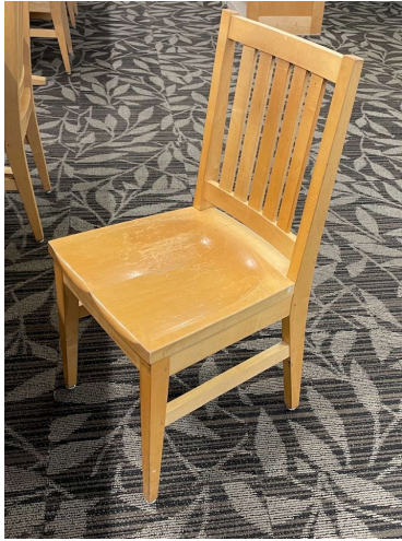
Wood reading chair