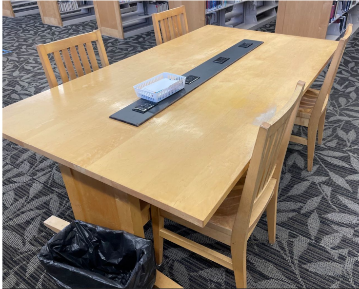
Wood table top with table top plug ins (not hardwire, standard plug)