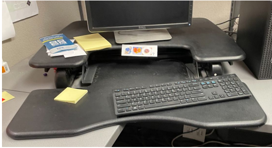
Vari desk Desktop riser 30"x30"