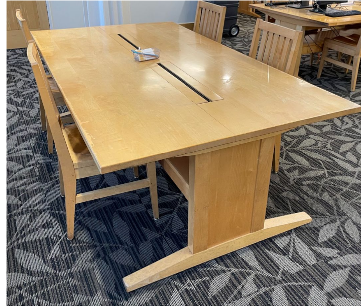
Wood table top with trough plug ins (hardwired, will be disconnected)