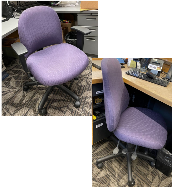
Task chairs - purple, various shapes