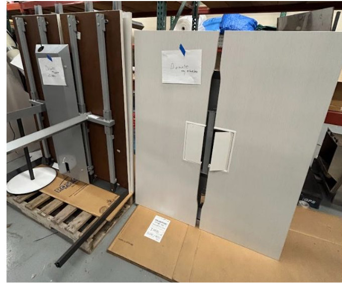
Double sided table system