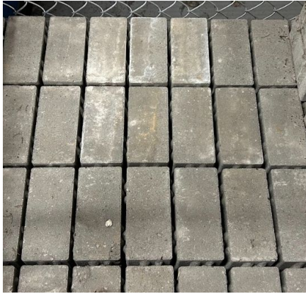
Grey brick pavers - 4"x8"?