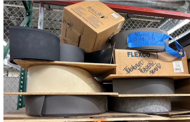
Rubber base trim, various colors