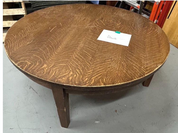
Large round children's table (or coffee table?)