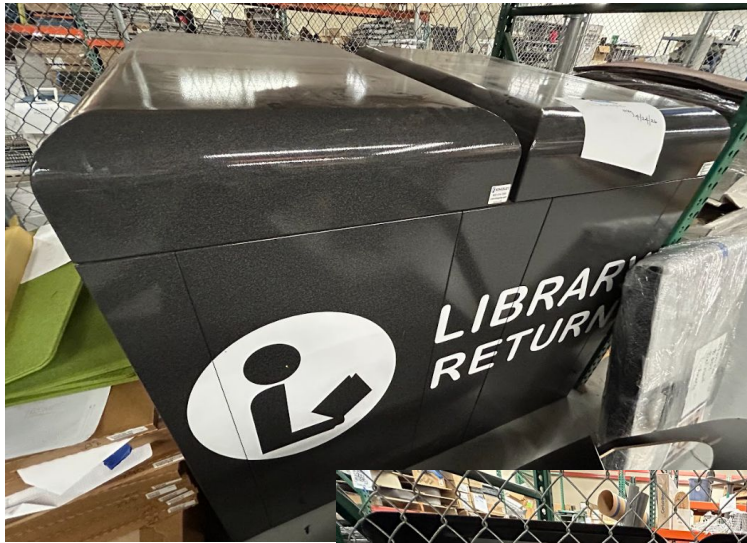
Double wide book return (for exterior)