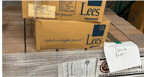
Red brick pavers- 4"x8"?