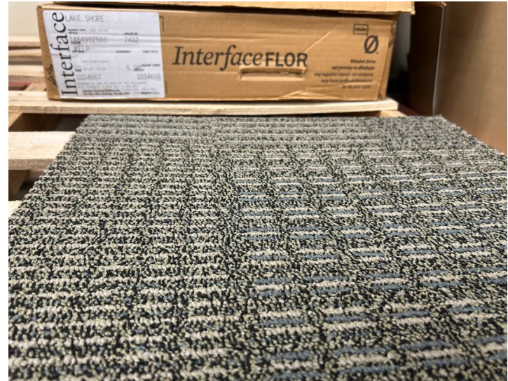
Carpet Tile Interface-Lake Shore