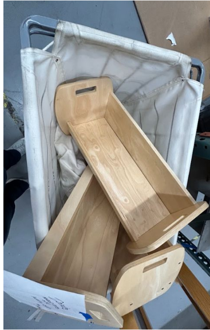
Small book bins