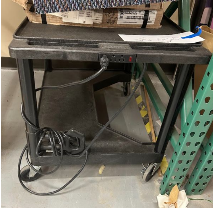
AV cart/mobile desk