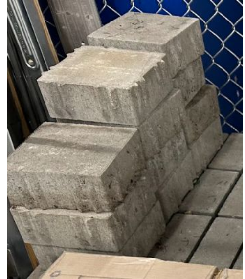
Grey square pavers/blocks 7.5" x7.5"