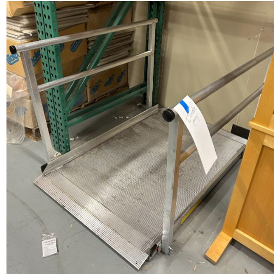
Solid surface ramp