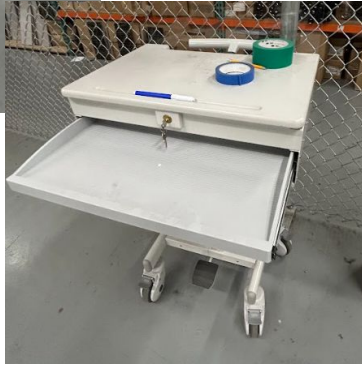
Medical cart or mobile podium