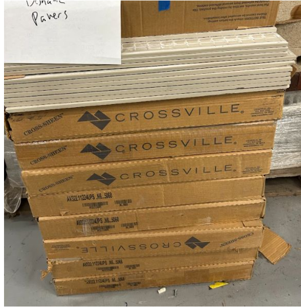
12x24 porcelain tile (grey generic) 8 tiles/box