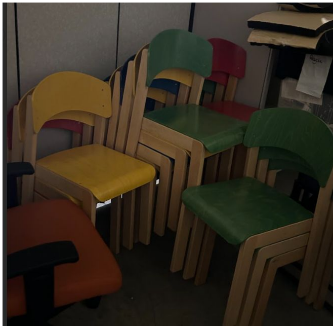
Colorful wood chairs (standard adult chair size)