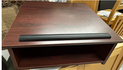
Desktop riser for display or podium- angled