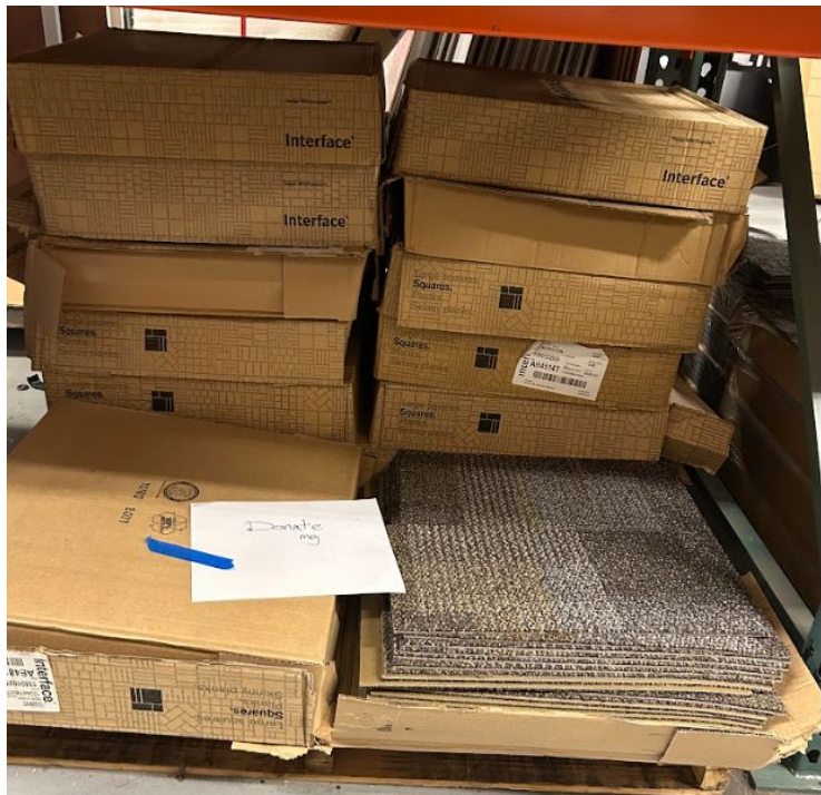
Carpet Tile Interface - Cubic