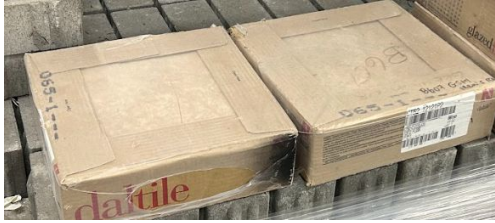
12x12 porcelain tile (light brown generic) 11sf/box