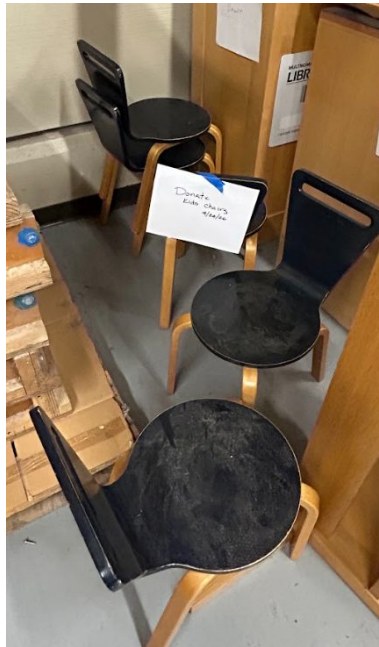
Dark blue children size chairs