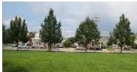
Before and after photos of the greening effort at 8th and Berks in Philadelphia. The after photo from 2013 (bottom) shows grown trees originally planted in 2008 (middle).

“When we engage youth, we are training the next work force. We need youth to be compensated for their time, to be able to translate their experiences into academics, a resume highlight and a career path.”