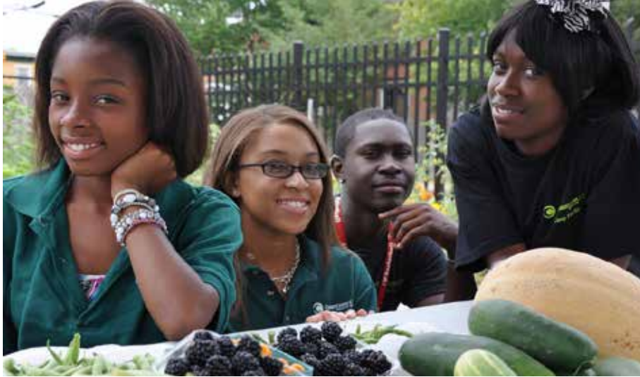
cc Christiana Care

“You can’t have health and wellness if you don’t have safety.”