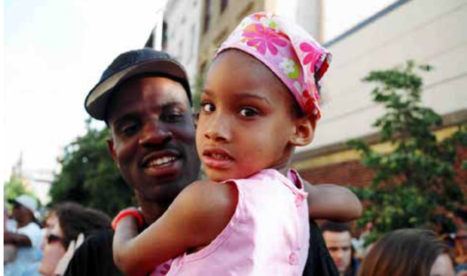
cc Elvert Barnes