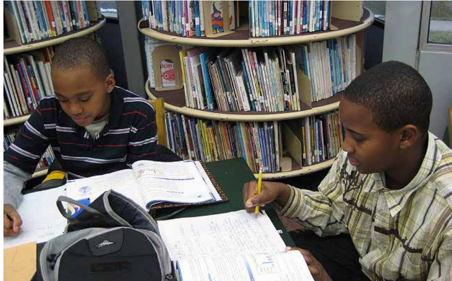
cc Glenwood-Lynwood Public Library District