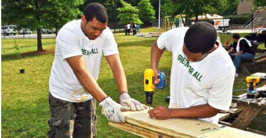
cc Green Jobs Now