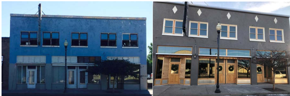
Central Hotel, Burns 2017 awarded project. Vacant for 40 years and now a hotel and two businesses.