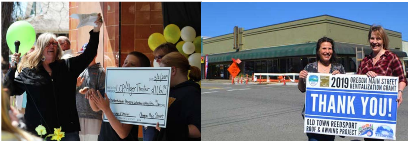
Celebrations in Lakeview and Reedsport!