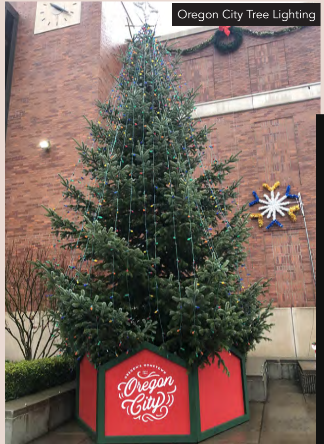
Oregon City Tree Lighting