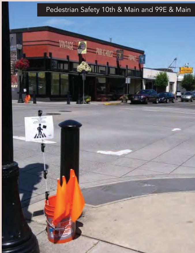
Pedestrian Safety 10th & Main and 99E & Main