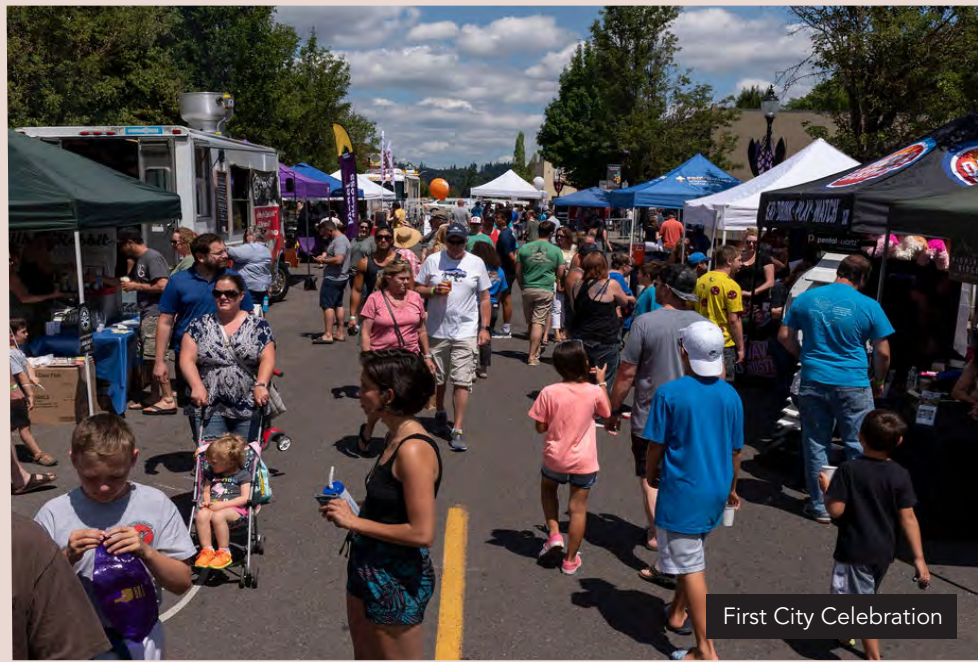
First City Celebration