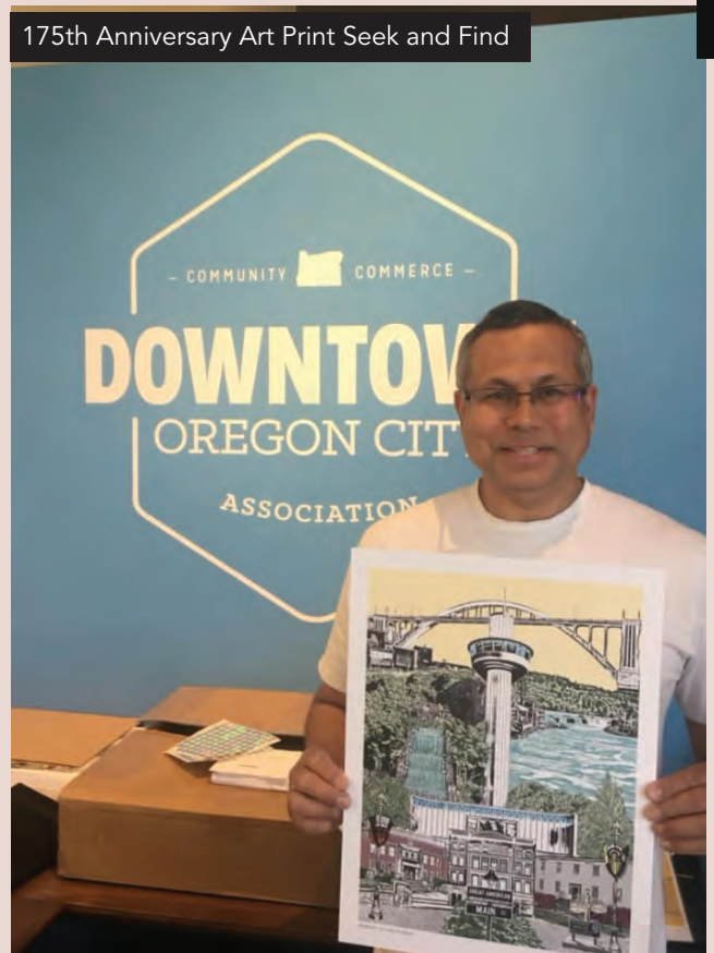
175th Anniversary Art Print Seek and Find