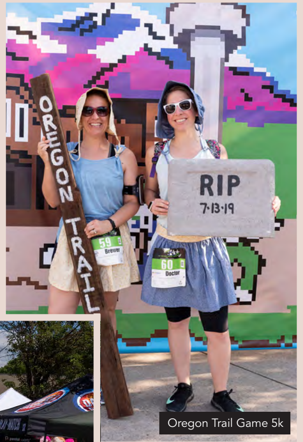
Oregon Trail Game 5k