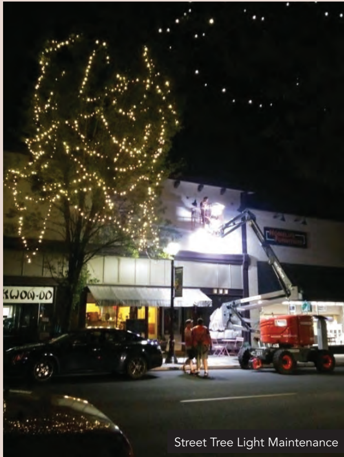
Street Tree Light Maintenance