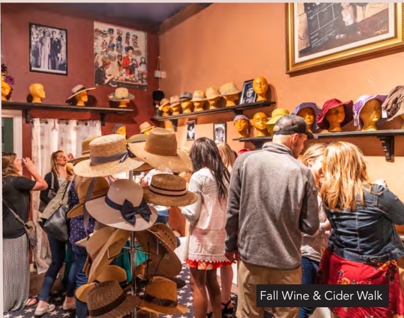
Fall Wine & Cider Walk