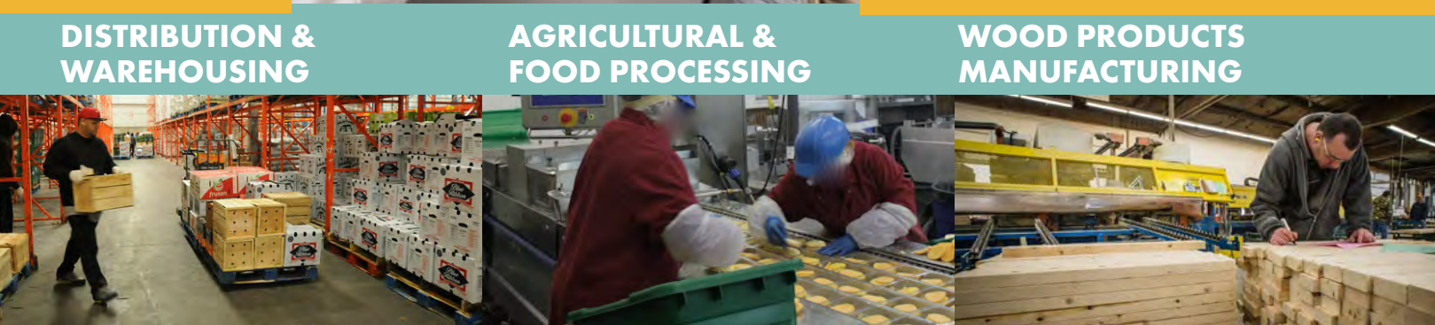
DISTRIBUTION & WAREHOUSING