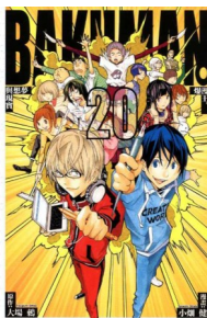
Bakuman, Volume 20