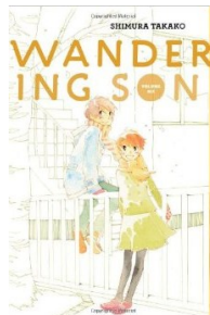
Wandering Son, Volume 6

Lives intersect in the most unexpected ways when teenagers Anne and Lewis cross paths at an estate sale in sleepy Failin, Oregon. Failin's businesses are crumbling, its citizens bitter and disaffected. Anne and Lewis refuse to succumb to the fate of the older generation as they discover the secrets of their hometown and their own families.