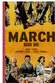
March: Book One