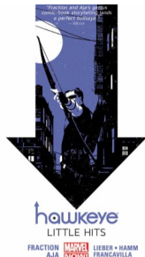
Hawkeye, Volume 2: Little Hits