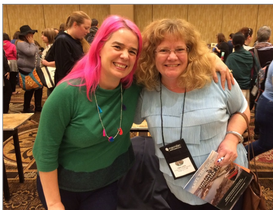
A personal highlight of the conference – meeting Laini Taylor!

So how did the national conference compare to our state one? The sessions were similar to what I've learned to expect from the OLA Annual Conference. This tells me that our Oregon librarians are doing a fantastic job putting on a quality, information-packed conference every year. Kudos to us! Where the national conference has us beat though, is in author attendance and the fabulous "Book Blitz" where I got to talk to so many wonderful authors and get free books too. It was also fun to network with librarians from all over the country and learn what's going on in other parts of the nation. Overall, I had a great time at the YALSA Symposium and am so happy that I got to attend that event, but it's also nice to know that OLA rocks too!