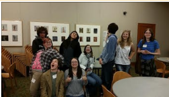
Jefferson County and Sandy Teens