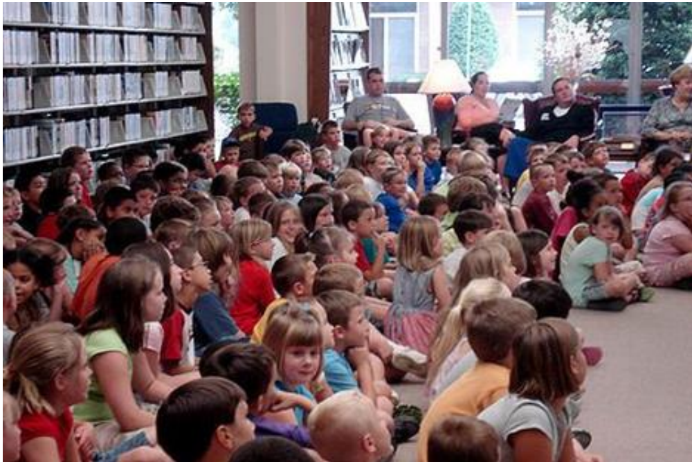
A million people attended storytime