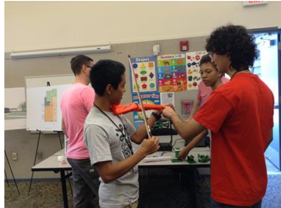
Four people attended Teen Tech Week