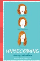
Unbecoming By Jenny Downham