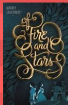
Of Fire And Stars By Audrey Coulthurst