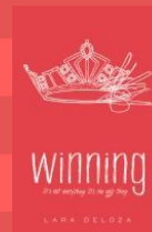
Winning