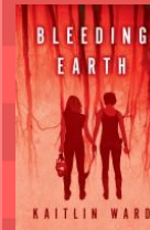
Bleeding Earth By Kaitlin Ward