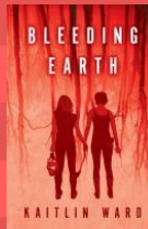
Bleeding Earth By Kaitlin Ward