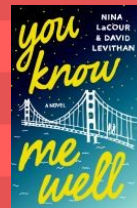
You Know Me Well By Nina LaCour and David Levithan