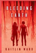
Bleeding Earth By Kaitlin Ward