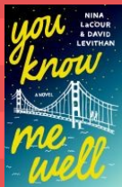
You Know Me Well By Nina LaCour and David Levithan