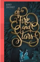
Of Fire And Stars By Audrey Coulthurst