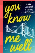
You Know Me Well By Nina LaCour and David Levithan