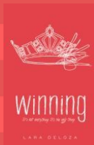
Winning