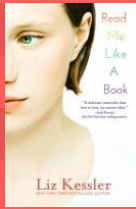
Read Me Like A Book By Liz Kessler