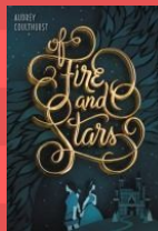
Of Fire And Stars By Audrey Coulthurst